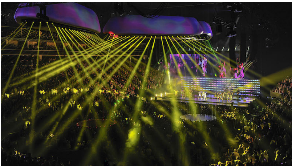
Robe beams in work on the Joanne Tour